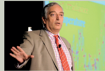
Lord Christopher Monckton

government hearings and the blogosphere that's well out of proportion to their actual knowledge about climate change. In a 2003 speech at Caltech entitled "Aliens Cause Global Warming", Crichton mocked the projections from global climate models, ignoring the differences between how weather and climate models work: "Nobody believes a weather prediction twelve hours ahead. Now we're asked to believe a prediction that goes out 100 years into the future". In State of Fear , Crichton alternated between nail-biting action sequences and tutorials in which the hero (and by extension the reader) discovers that the consensus on global warming is full of holes. It's surely the first blockbuster novel to include more than 25 actual graphs of long-term temperature trends at stations