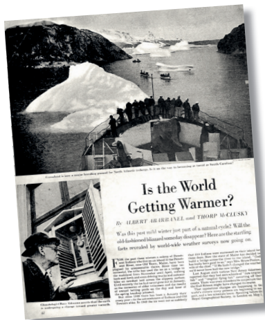
This Saturday Evening Post article from 1950 was one of the very first stories on climate change in the popular press.

The landscape of climate-change debate has grown far more complex since the Kyoto Protocol – the first global agreement to reduce greenhouse-gas emissions – was introduced in 1997. While the issue is often portrayed as a one-side-versus-the-other battle, there’s plenty of nuance in the mix, even among those who agree on the big picture. Many corporations have taken up the banner of reducing emissions, in order to save on their energy costs as well as burnish their green credentials. And environmentalists have fiercely debated many angles among themselves, including the pace at which emissions ought to be reduced and the merits of nuclear power in a greenhouse-threatened world. The scene grew even more muddled in 2009–10, as a batch of emails leaked from top climate scientists triggered controversy, while international squabbling dimmed the chance of a new global agreement on emissions reduction. All this has unfolded despite the fact that the world’s leading scientific societies – including the national academies of more than 30 countries – stand firmly behind the recognition that humans are changing the climate.