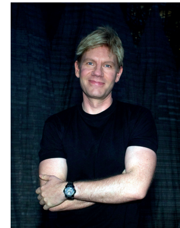
Bjorn Lomborg: climate sceptic? A pro-

The release of the IPCC's second assessment in 1995 drew one of the decade's sharpest rounds of sceptic vitriol. The report's beefed-up assertion that "the balance of evidence suggests a discernible human influence on global climate" was based in part on detecting climate-change fingerprints , the 3-D temperature patterns one would expect from the observed increase in greenhouse gases (as opposed to different patterns of warming that might be produced by other factors, such as strengthening solar input). A pro-