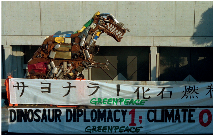
Greenpeace protesting against “Dinosaur Diplomacy” at the Climate Conference in Kyoto, Japan, 1997.

change threatens to affect every country on Earth in one way or another. It's hard to motivate people to grapple with such an immense and seemingly intractable issue, and the many options for political and personal action could be too much to process. Moreover, even more than smog or acid rain, human-induced climate change is a classic “tragedy of the commons” – the benefits of burning fossil fuels accrue to individuals, companies and nations, while the costs accrue to the planet as a whole. And while the activists urged concrete action, the benefits – avoiding a global meltdown – were intangible as well.