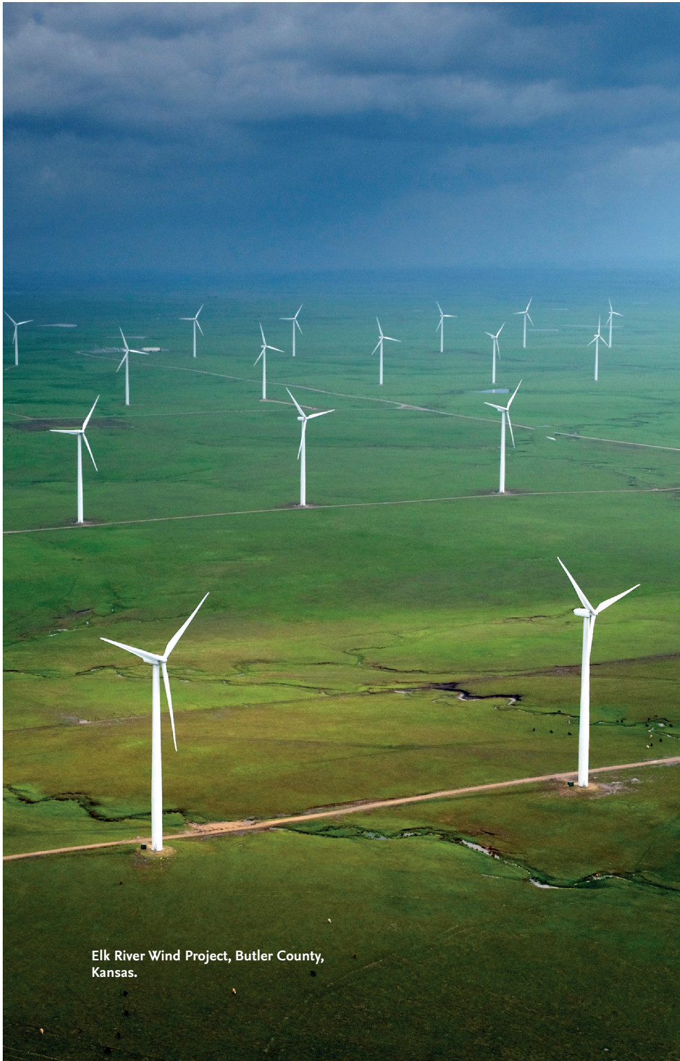
Elk River Wind Project, Butler County, Kansas.