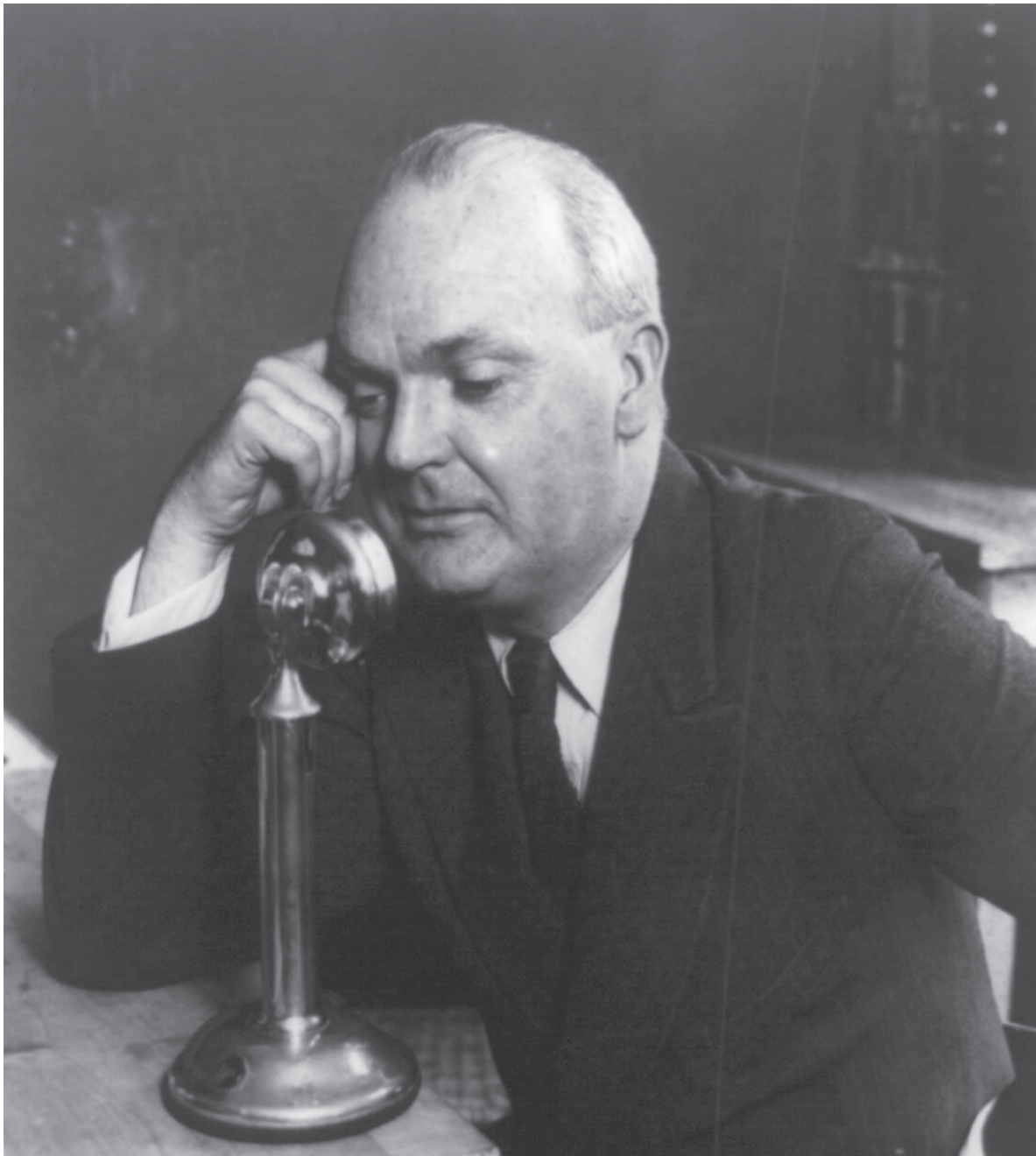
FIGURE 1. Dudley Field Malone. Undated; Library of Congress LC-USZ62-87882.